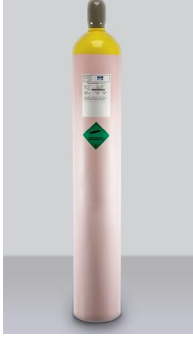
50Lt Aluminium Cylinder